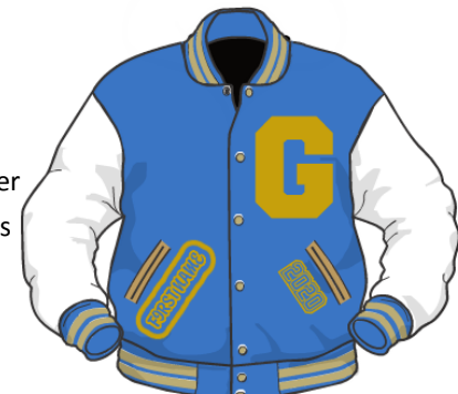
Color Option 2