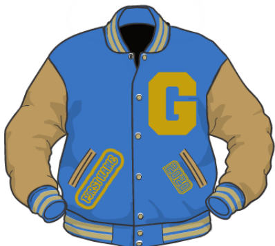
Color Option 1

Minimum 50% Down Payment to start production of your jacket Interest FREE Payments! Tax and Handling will be added to your order We gladly accept All Credit/Debit Cards, Cash, Checks & Money Orders *We DO NOT accept Personal Checks at the delivery of your letter jacket